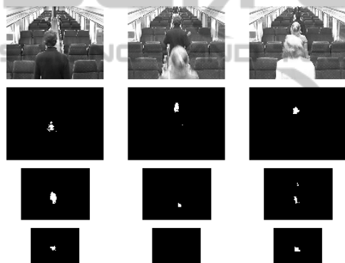
Figure 2: The input image at the largest scale and the results of the Adaboost classification at all three scales.

The adaboost boosting algorithm (Freund and Schapire, 1997) is used to create a robust classifier out of multiple weak classification units. Some results of the classification are shown in Figure 3.2.