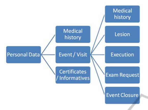
Figure 4: Measured vs Standard Haemodynamic Response.