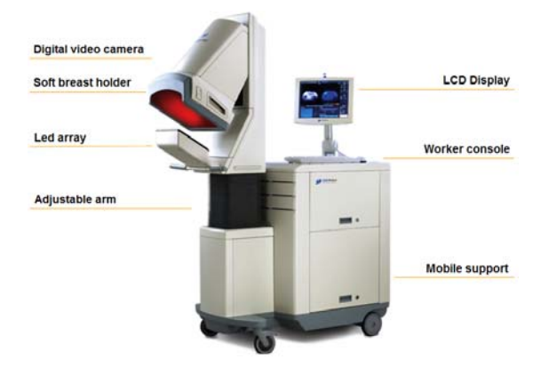
Figure 1: The ComfortScan System.

ComfortScan (Figure 1) is a system based on DOBI and designed to detect dynamic (physiologic) changes, increased blood volume levels and depleted oxygen levels (deoxygenated haemoglobin), that characterize malignancies. It consists of the following primary components: