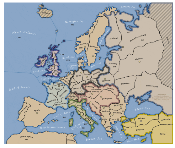
Figure 1: The Diplomacy gameboard.

Figure 1 shows the standard Diplomacy gameboard. There are 75 provinces on the board (81 if coastal areas are taken into account), which are connected along their borders, complicating the connections between them. There are also three different types of provinces: coast, land, and sea. Land areas can only be occupied by armies, sea areas can only be occupied by fleets, and coastal areas can be occupied by either. The small circles on the map are supply centers. The objective of the game (and the goal of the search algorithms described in this paper) is for one player to control 16 supply centers by either having been the last player to pass through that province (it is actually a little more complex in the game since control of supply centers is determined on every other turn that has been ignored for the purposes of this study) or to have a unit in the province.