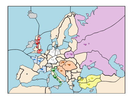
Figure 3: A Diplomacy gameboard showing the starting locations and unit types for each player.

Figure 3 shows the starting positions and unit types for each of the seven players in Diplomacy : Austria, England, France, Germany, Italy, Russia, and Turkey. Each of the players starts with three units, except for Russia, which starts with four. These starting positions and unit types are critical to this comparison of search algorithms as they comprise the first ply of the search tree for each of the players.