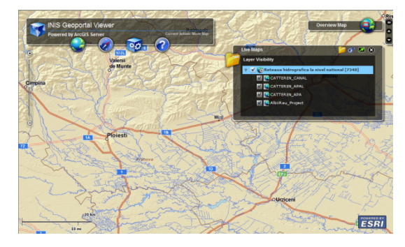
Figure 3: Romanian INIS GeoPortal - customized map viewer.

Inside the Romanian INIS GeoPortal was developed a customized map viewer presented below in Figure 3, dedicated for the INIS Council users.