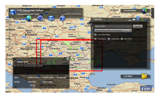
Figure 4: Romanian INIS GeoPortal published resources available – Live data and maps.