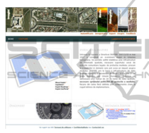
Figure 1: Romanian INIS GeoPortal home page.

The Romanian INIS GeoPortal (Figure 1) developed by ESRI Romania is designed to facilitate the discovery and exchange geospatial data resources to a broader community of users. By the end of 2009, the National Center for Geodesy, Cartography, Photogrammetry and Remote Sensing completed a complex project which is a major milestone of the NSDI building efforts compliant with the INSPIRE.