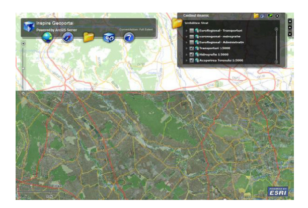
Figure 2: Romanian INIS GeoPortal – first published resources.

The first version of the Romanian INIS GeoPortal provides access to the following resources: Romanian Base Map-TopRo5, at 1:5.000 scale, orthophotos at 1:5.000 scale, raster datasets including scanned maps, topographic maps and digital elevation models, network services and applications (Figure 2).