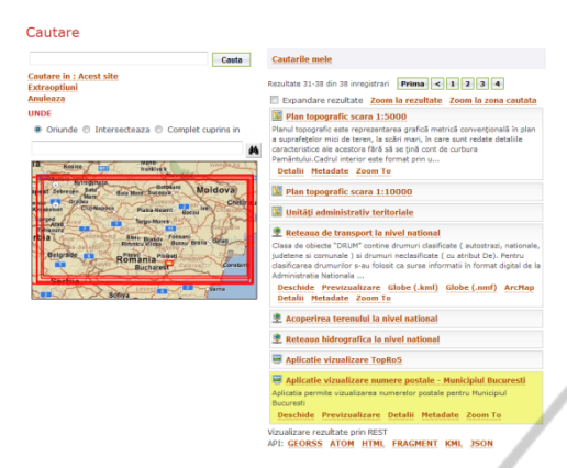
Figure 6: Romanian INIS GeoPortal search results – REST API interface.