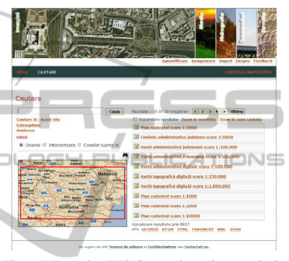
Figure 5: Romanian INIS Geoportal search type – basic option.

There are two search options available in the Romanian INIS GeoPortal: a) basic and b) advanced. The basic option (Figure 5) is accessed directly from the GeoPortal home page and the results will display in the search results page.