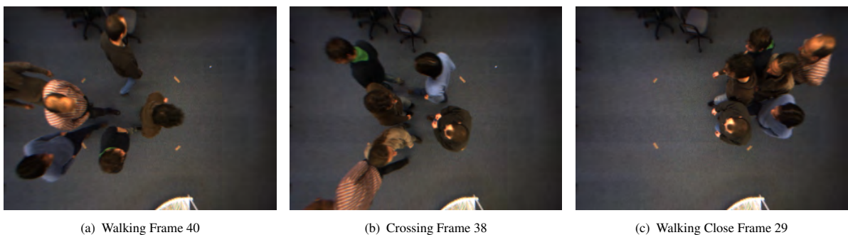
(a) Walking Frame 40