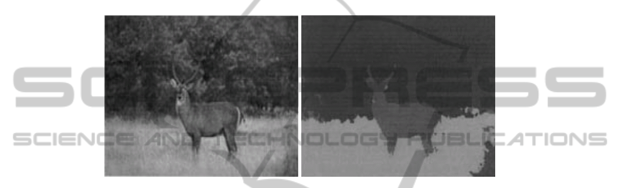
Figure 5: Salience by segmentation (Pauwels and Frederix, 1999) may yield real-world meaningful regions [Source: Reprinted from Computer Vision and Image Unerstanding, Vol. 75, numbers 1–2, E. J. Pauwels and G. Frederix, Nonparametric Clustering for Image Segmentation and Grouping, Pages 73–85, Copyright (1999), with permission from Elsevier].

Figure 4: Some results and applications of detecting salience as understood by (Boiman and Irani, 2007).