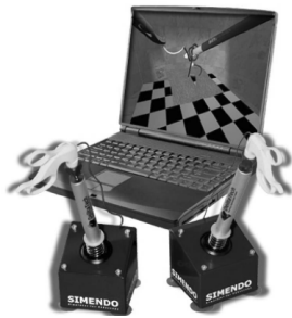
Figure 3: Simendo – a virtual reality trainer developed by DelltaTech.