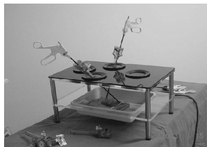
Figure 2: A box trainer used to train basic MIS skills.

In surgical trainers, and especially in VR trainers, there is a tendency to imitate reality as much as possible. It is, however, not known whether training on the high-fidelity trainers is the most effective one for learning basic MIS skills (e.g. eye-hand coordination) (Dankelman, 2005). In contrast to animal models and human cadavers, which allow training of various surgical skills, box trainers and VR trainers are mostly used to train psychomotor MIS skills only.