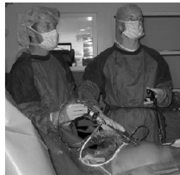
Figure 1: The view of the operating room during MIS procedure. The patient is lying on the operating table in the supine position. The surgeons lead the operation from the left side of the patient. The camera operator stands next to the surgeon. Both the surgeon and the camera operator watch the operating area on a monitor (not presented in this picture).

It is evident that proper education of future surgeons is crucial for patient safety. However, standardized training curricula and objective assessment methods are lacking. This paper presents the state of the art on training and assessment of MIS skills, and discusses remaining challenges.