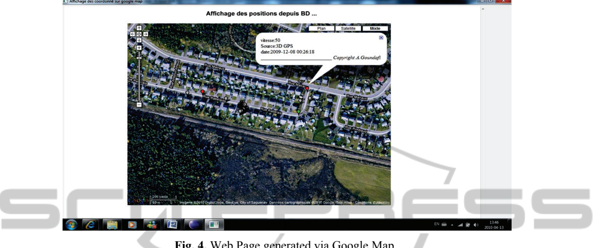
Fig. 4. Web Page generated via Google Map.

research, we suggest the use of an encryption algorithm for secure radio data. The algorithm must be light enough not to take a fairly limited bandwidth with the radio systems.