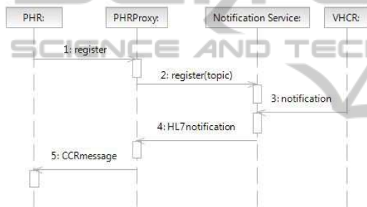
Figure 2: PHR notification through proxy.

to CCR standard, which can be interpreted and integrated by Google Health. The process is described in detail in fig 2.