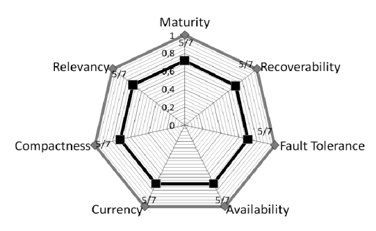
Figure 3: Reliability quality factor evaluation for the Tool Support characteristic.

considered for the evaluation of the Reliability quality factor about NDT methodology. In this case, is seen that NDT is better in Recoverability and Fault Tolerance than in Maturity, Relevancy, Compactness and Currency.