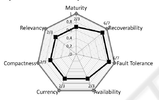
Figure 4: Reliability quality factor evaluation for Tool support and MDE characteristics.

considered for the evaluation of the Reliability quality factor about NDT methodology. In this case, is seen that NDT is better in Recoverability and Fault Tolerance than in Maturity, Relevancy, Compactness and Currency.