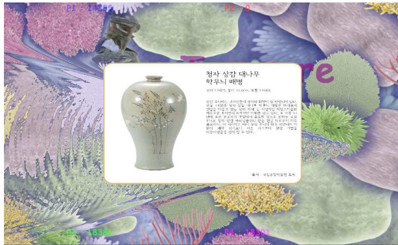
Figure 2: Wave Touch.

We have just recently finished developing the two aforementioned games, so we have not had an opportunity to conduct a full-fledged user evaluation. We have, however, had several participants experiment with the games and provide us with some initial feedback. Almost all participants commented on how pleasing the multi-touch interface was, with several remarks alluding to its attractiveness and ease of use. Everyone appeared quite engrossed in the applications, largely in part due to the touch interaction. There was almost unanimous agreement preferring this type of interface to conventional computers for group activities. Several participants enjoyed the social atmosphere afforded by the tabletop environment. With the Wave Touch game, we overheard a lot of enthusiasm and cooperation between the participants with remarks such as "Oh there it is!!" and "I just saw it! Go up, go up!" There were also minor discussions sparked by game content (e.g. in Block Earth, when surprised about the population size of a particular city, users would comment on that subject). Essentially, these preliminary reactions demonstrate the dynamic atmosphere that interactive tabletops can provide and reinforce some of our claims about why they can enhance the effectiveness of educational games.