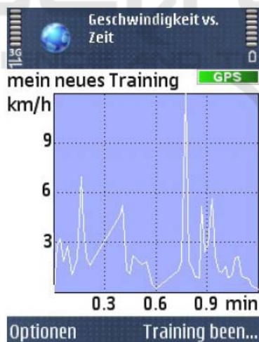
Figure 4: Screenshot from the mobile client.

Additionally the current song and a table with statistics for the training so far are possible screens. A map view showing the position of the user and also the selected trail if desired, can be displayed on the mobile phone as well if a mobile data connection is available.