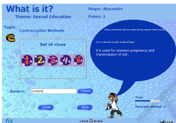
Figure 1: The player's module main interface.

"What is it?" has the differential in considering the players' profile, concerning the games presented in the previous section. Since the players have to subscribe themselves in the system before starting to use it, the new statements collected in the interaction can be related to their profile. Taking into account the players' profile collected is especially important for the culture sensitive approach necessary in developing applications for specific groups in a certain region and age, considering their context. In this case, the common sense knowledge can be filtered and the application's designer can consider only knowledge collected from a desired profile in order to contextualize it to the target group.