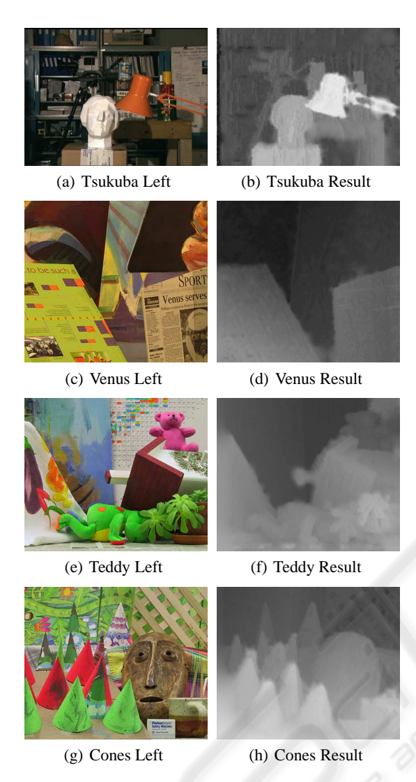
Figure 2: Disparity results (b,d,f,h) for the Middlbury stereo data set (a,c,e,g). The algorithm returns a dense disparity map with captures the basic 3D structure of the scene. Near occlusion edges, however, errors are visible as can be seen for the lamp arm (b).

are mostly resolved, however, at regions with occlusions, the correct disparity at boundaries could not always be found, for example the lamp arm in Tsukuba (Fig. 2b), or for the Teddy stereo pair (Fig. 2f). Decreasing \kappa_n may decrease these undesired blurring effects. However, a lower smoothing parameter may also increase the convergence time.