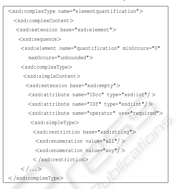
Table 2: Example of definition of a quantification : The quantification of the formula 1 of the constraint 1 is \forall Diploma.

Table 1: Definition of the new element "quantification".