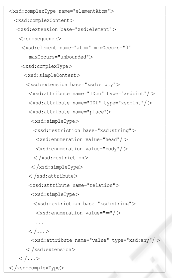
Table 4: Example of definition of an atom : An atom of the formula 1 of the constraint 1 is a condition (head) and concerns the element "field". It can be binded to the quantification defined previously. It means " \forall Diploma[field \neq "Computer Science"...]"