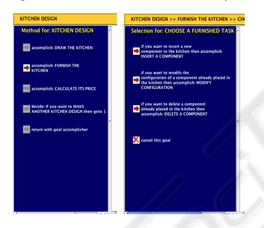
Figure 2: Example of GDW, of a GDUI, offering a method (left) and a selection (right).

Otherwise, if in order to reach a current objective the user must perform a selection , the GDW will show the different alternatives that the selection consists of, in such a way that the user can choose one (Figure 2, right). Although somewhat unusual here, the user may also be offered the usual choices existing in the direct manipulation WIMP type interfaces, although they are not actually in the GDW, but are in the WW. In this case, the GDW must provide the user with the method to be followed in order to perform the selection properly.