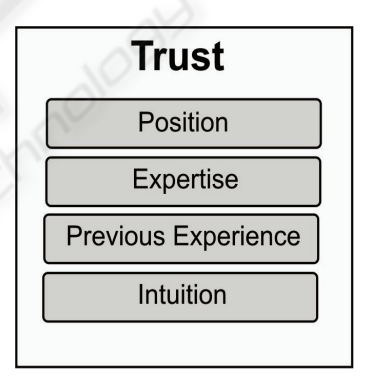
Figure 1: Trust Model.

By taking all these factors into account, we have defined our own model with which to rate trust in CoPs, and this is summarized in Figure 1.