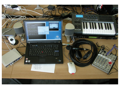
Figure 3: Musician apparatus.

The three musicians were distributed in three different buildings in the campus network of the MTA Department and they were connected through the DIAMOUSES Streaming Server, which was located at the same building as one of the musicians. The provided network connection was a 100Mbps Local Area Network connection. For the streaming server a customised version of Darwin Streaming Server was used, running on Red Hat Enterprise Linux 5.