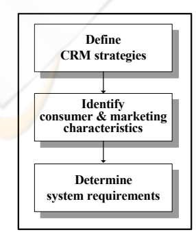
Figure 3: Theoretical model.

Theoretically, the solution for this problem would be based on a strategic perspective to pre-define marketing orientation. Accordingly, system requirements would be effectively determined from a high-level perspective. Thus, this research proposes a strategy-based process for effectively defining system requirements in eCRM development, as indicated in Figure 3. The theoretical basis for building this model is mainly based on the analysis of a hierarchical structure with firm strategies at the top, business processes at the second, tasks at the third, and information at the bottom, as discussed in Section 2.1. This process basically contains three steps: (1) define customer strategies, (2) identify consumer and marketing characteristics, and (3) determine system requirements. Prior research has just literally discussed the importance of strategic determining system requirements. role in Furthermore, a well-defined process for requirement analysis has not reported integratively.