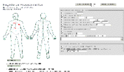
Figure 2: Procedure Registration in the EMR.

gence” of the system as a whole arises from the interactions among all the system’s components. The interfaces are based on Web-related front-ends, querying or managing the data warehouse. Such an approach can provide decision support. A context dependent formalism has been used to specify the AIDA system incorporating facilities such as abstraction, encapsulation and hierarchy, in order to define the system components or agents; the socialization process, at the agent level and the multi-agent level, following other possible way of aggregation and cooperation; the coordination procedure at the agent level; and the global system behaviour. The data can also be used for educational and training purposes because maybe one of the unique cases can be identified and used in expert system like applications to advise practitioners ((Analide et al., 2006)). An screen view is shown in Figure 2.