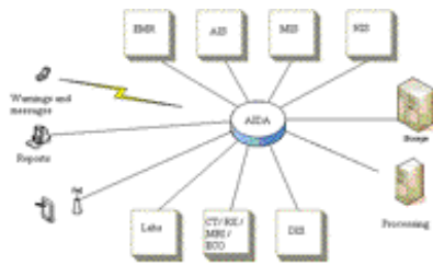
Figure 1: AIDA.