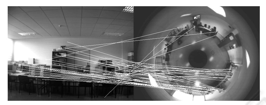
Figure 3: Matching between omnidirectional and perspective image using the unwrapping and the hybrid EG as a tool.