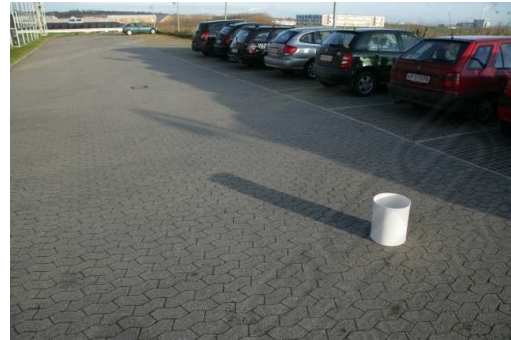
(a) Input image

Figure 3 visually illustrates the illumination estimation for a given scene. Notice how the color of the Sky dome corresponds to the actual Sky color in the image, although this information has not taken part at all. The only information used is the overlay color resulting from finding the intensity ratio between a region in direct light and a region in shadow.