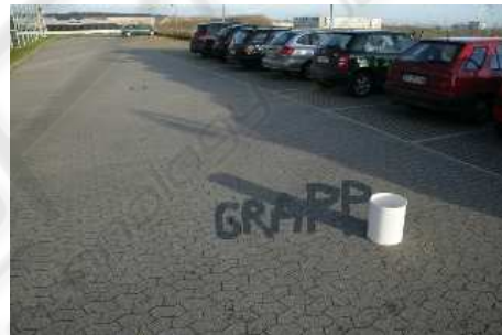
Figure 5: Shadow manually drawn into image. The pixel values inside the artificial shadow is automatically determined. Using this approach we intend to solve the shadow protection problem in order to avoid double shadows.

It would also be interesting to measure the performance of the technique presented in this paper against light probe images to establish the degree of absolute accuracy.