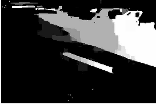
(b) Detected shadow levels