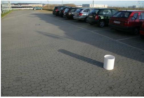
(a) Input image