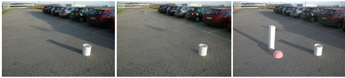
Figure 1: Illustration of idea in this work with images. Left: input image acquired outside in sunshine. Center: real shadows automatically detected and removed to illustrate performance of detection. Right: information from shadow detection step has been used to estimate Sun and Sky illumination conditions and virtual objects have been rendered into the scene with credible shading and shadowing.

The general idea in the work presented here is that the outdoor (daylight) illumination conditions can be modeled quite accurately by a distant disk light source (the Sun) in combination with a Sky dome. We assume the radiance of the Sky dome is the same over the entire hemi-sphere. The respective radiances of the Sky and the Sun are estimated based on information from an automated shadow detection process. That is, the shadows already present in the image provide the only source of information for the parameters of the illumination model (a part from the position of the Sun, which is found procedurally from date, time and Earth location information). Figure 1 shows an example of application of the techniques presented here.