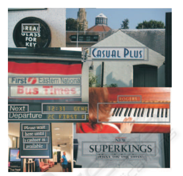
Figure 3: Some result of the proposed approach on the ICDAR'03. test set.

We have presented in this study a convolutional neural network-based text detection system that learns to automatically extract its own feature set instead of using a hand-crafted one. Furthermore, the network learned not only to detect text in its retina, but also to reject multiline or badly localized text. Thus, the exact text