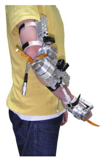
Figure 2: Upper limb robotic exoskeleton. The device spans the human elbow and wrist joints.

MathWorks, Inc. This environment provides mathematical libraries making it easy to implement control strategies. The algorithm can be coded in C-language and compiled in an executable application.