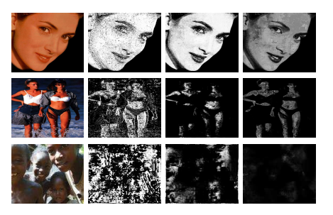
Figure 1: Some inputs (color images) and outputs (grayscaling images) of the three compared models.

All the elements of equations (11) and (12) are previously computed in the procedure 1.