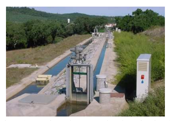
Figure 1: Experimental water canal at the University of Évora.