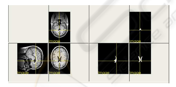
Figure 2: Comparing images with a Viewer.

tions. The bottom panel of Figure 1 simply displays a trace of underlying configuration actions for debugging purposes during development of ITKBoard.