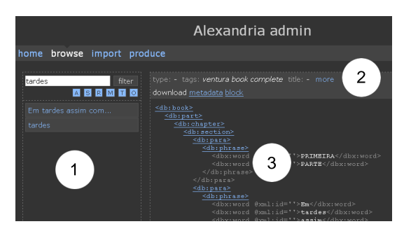
Figure 3: Browsing Instance.

tags summaries are navigable objects mapped into search tasks, providing the user with other browsing possibilities;