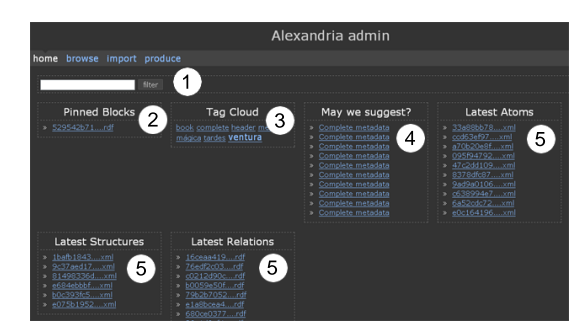
Figure 2: Browsing Overviews.

Faced with millions of multimedia fragments, users may feel daunted on choosing a starting point for working on repository's contents. Overviews provide different possibilities for browsing the repository and start new tasks, as seen on Figure 2. Five overviews are provided: