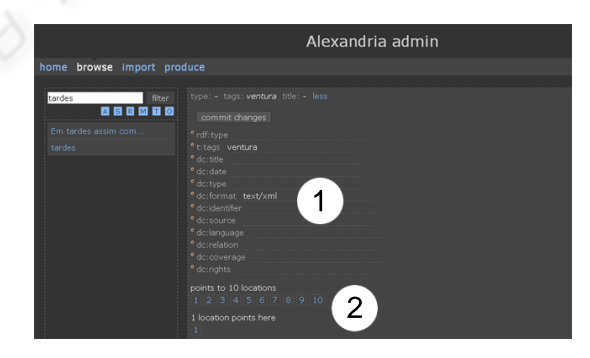
Figure 4: Metadata view for Browsing Instance.

Expading the metadata summary, a full view is presented (Figure 4). Here, users are able to: (1) view and edit metadata fields, and (2) view different available navigation possibilities (inclusion, composition, and relations) for exploring the repository, based on the current browsing instance. It is worth noticing that metadata fields are also starting points for exploratory tasks from the user (similar to Tag Cloud browsing).