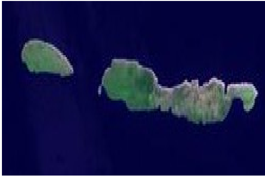
Figure 3: LANDSAT 7 ETM+ image of a part of Kvarneric islands, Croatia. Approximate scale 1: 0.952 sq km.