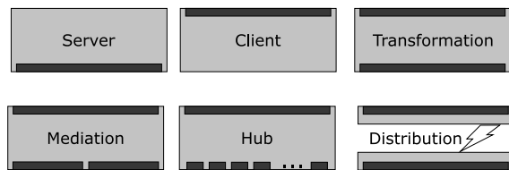
Figure 1: Six kinds of modules.

need to be recorded. In addition CCMSs acknowledge that the user community might not agree on the appropriate schema for the domain. Therefore, each user (or group of users) is permitted to modify the schema according to their personal opinion. We call this (schema) personalisation. As many such personalisations might occur in parallel, the system generally has to cope with many coexistent schemata.