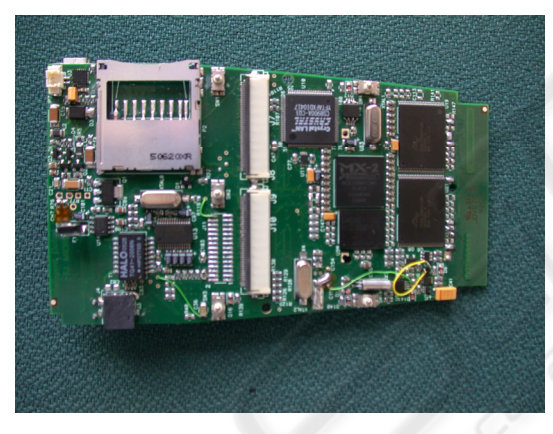
Figure 3: Real system.

The dedicated operating system offers the appropriate services for managing the system hardware resources: display, printer, smart power supply, etc.