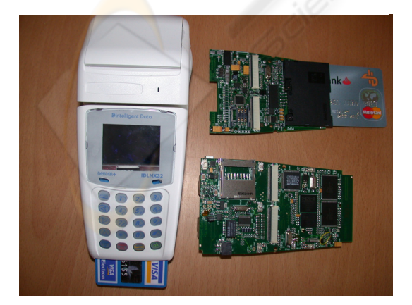
Figure 4: Real system.