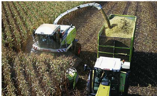
Figure 1: Forage Harvester

Nowadays more and more powerful machines become available in agriculture. Therefore speeds in harvesting and harvesting tonnage increase. Keeping the modern fast continuous overloading machines in a proper relative position during the whole harvest imposes a significant stress upon the drivers. In order to