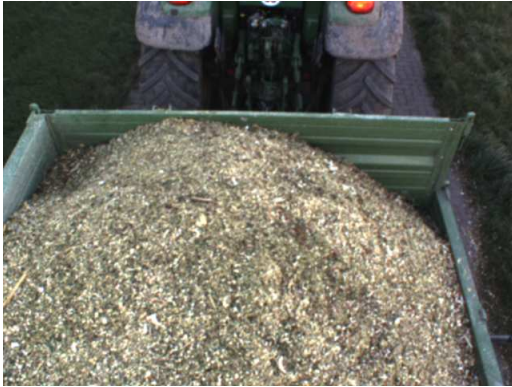
Figure 3: freight car being loaded

The RGB image is initially converted into gray-scale. After that an algorithm is applied to compensate non-uniform illumination and to provide a roughly uniform contrast all over the image. Figure 3 shows shadows projected from the freight cars walls in the regions close to the corners of the freight car. It can