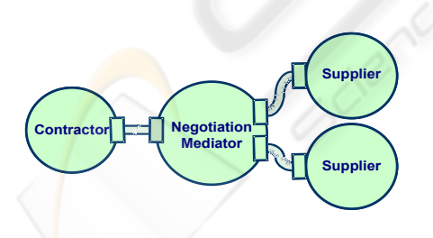
Figure 1: Architecture for negotiation process

The set of suppliers concerned by the negotiation depends on the offer. As there are several negotiations, the suppliers are not always the same. So, the architecture evolves during the production plan construction. Thus, the architecture needs to be dynamically evolutive.