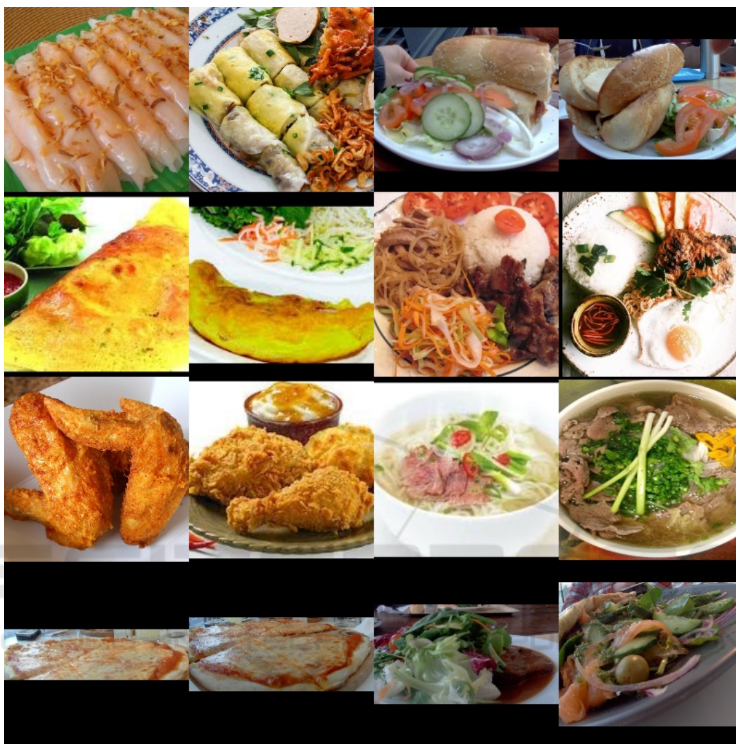
Figure 4: The lifelog food dataset with 8 different types of cuisines.

After computing the corresponding features (SIFT, SURF, and HOG) in each image, we choose appropriate classifiers by comparing two traditional classification approaches, SVM and XGBoost. Using the training/validation/testing dataset, we find the best parameters for each classifier. More detailed, by choosing various values for different parameters, we train the corresponding models from the training data and evaluate them on the validation set. Next, we select the best parameters having the best performance on the validation set and check again on the testing data.