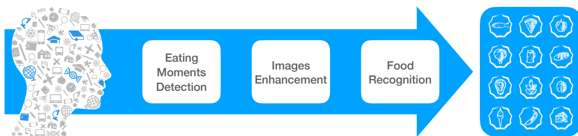
Figure 1: The proposed schema of the food recognition system.

Lukas Bossard et al. (2014) and colleagues proposed a novel approach by using Bag Of Words, Improved Fisher Vector and Random Forests Discriminative Component Mining for building a food detection system. In addition, they also contribute a large dataset of 101,000 images in 101 food categories, namely Food-101. Related to Japanese food recognition, Yoshiyuki Kawano and his team built a Japanese food recognition system Yoshiyuki and Keiji (2014) and introduced a dataset of 100 different popular foods in Japan (UEC-100) by leveraging Convolutional Neural Networks (CNNs). The authors later improved their performance on a new dataset of 256 types of food in different countries (UEC-256) by constructing a real-time system that can recognize foods on a smart-phone or multimedia tools Kawano and Yanai (2015) which could achieve around 92% in top-five accuracy. Their approach performed well also when it is applied later on other datasets: PASCAL VOC 2007 3 , FOOD101/256 and Caltech-101 4 . Ge and his co-workers Ge et al. (2015) using a local deep convolutional neural network to improve Fine-Grained Image Classification on both Fish species classification and UEC Food-100 dataset.