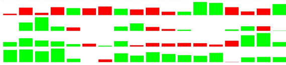
Figure 5: Examples of the images obtained by the VizMal variant with binary maliciousness level and activity level related to number of system calls for the same execution traces of Figure 4.