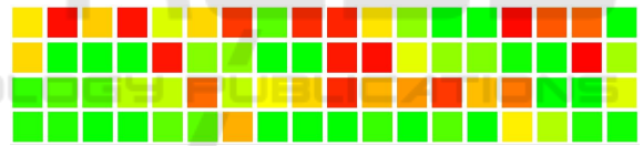
Figure 6: Examples of the images obtained by the VizMal variant with continuous maliciousness level and no activity level for the same execution traces of Figure 4.