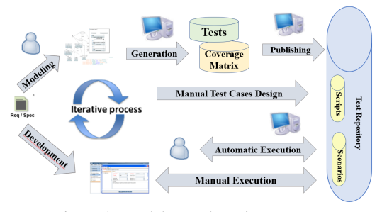
Figure 1: Model-Based Testing process.