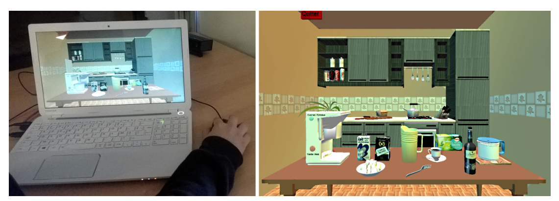
Figure 2: Experimental setup (left) and screenshot of the coffee task (right) from our previous work.

line with our previous work on IADL assessment in impaired people (Allain et al., 2014; Richard et al., 2010). More clearly (see Fig.2), we will use a system based on VR, but non-immersive, which proposes to perform a coffee-making task, in a virtual kitchen (Richard et al., 2010). Coffee-making tasks are commonly used in the ecological assessment and rehabilitation of IADL (Allain et al., 2014; Foloppe et al., 2015; Zhang et al., 2003). In our task, patient has to pick and place virtual objects, in order to prepare a cup of coffee with milk and sugar. The mouse allows controlling the position of the virtual objects on the vertical and horizontal axis. The virtual objects are automatically moved in depth. A behavioral analysis according the omission-commission is available (Allain et al., 2014). We plan to integrate the analysis of mouse data, and complete the behavioral analysis.