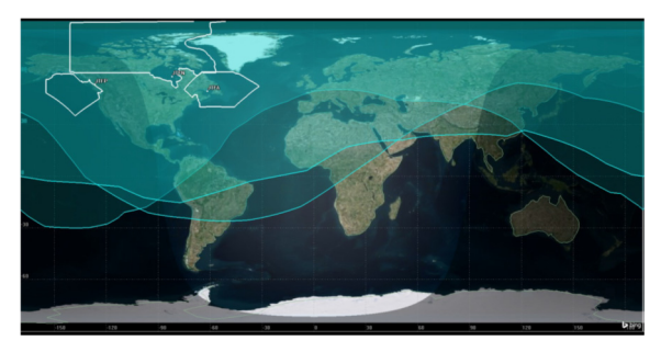
Figure 1: Three Canadian AORs (white outlines) and the exactView-1 AIS sensor FOV (cyan overlay) over time when access is available to each AOR.

These line-of-sight analyses are referred to in STK as access calculations.