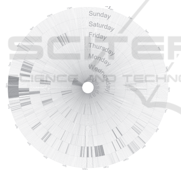
Figure 3: View of the circular heat chart. Each ring represents a day and is composed of 1440 cells (one per minute of a day) colored according to the calories expended.

Finally, the user interface provides a simple yet useful tool for insight annotation. Users can annotate the discovered insights by inserting a title and a description. This self-reflection insight reporting functionality was added following (Choe et al., 2015) findings and their recommendation to support easy capture of self-reflection insights against specific elements of a dataset that may be associated with the insight, and access them both for exploration and for presentation purposes. Saved annotations are linked to the user-selected parameters, so that the associated visualization can be easily accessed in the future.