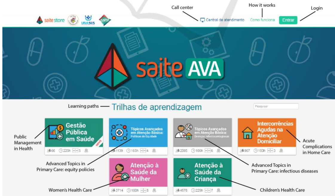
Figure 1: Saite AVA homepage.

When logging in to the system, the user has access to the Student Dashboard, where the Performance Monitoring Area can be found on the left. This provides information about the history of notes and their performance in the course, represented by a graph that indicates the current user status with color, percentage, and a dialog box that indicates whether student performance is satisfactory or not.