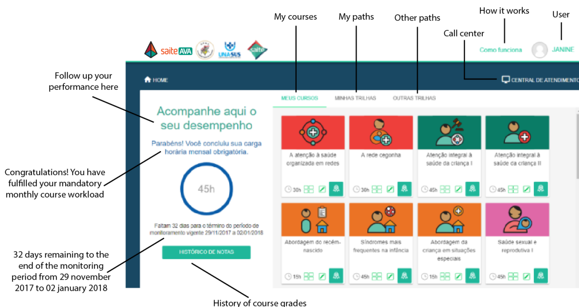
Figure 2: Student dashboard with satisfactory workload preview.

Other functionalities that can be found: My courses - where the student visualizes the courses that he is doing at the moment; My paths - view the paths currently performing; and Other trails - provides access to the other paths available for registration. In addition, below the boxes of the courses and tracks, there are icons that show the information: Course workload; If the student has finished reading the content; if one has already performed the activity; and whether the certificate is available. All accompanied by labeling tooltips.