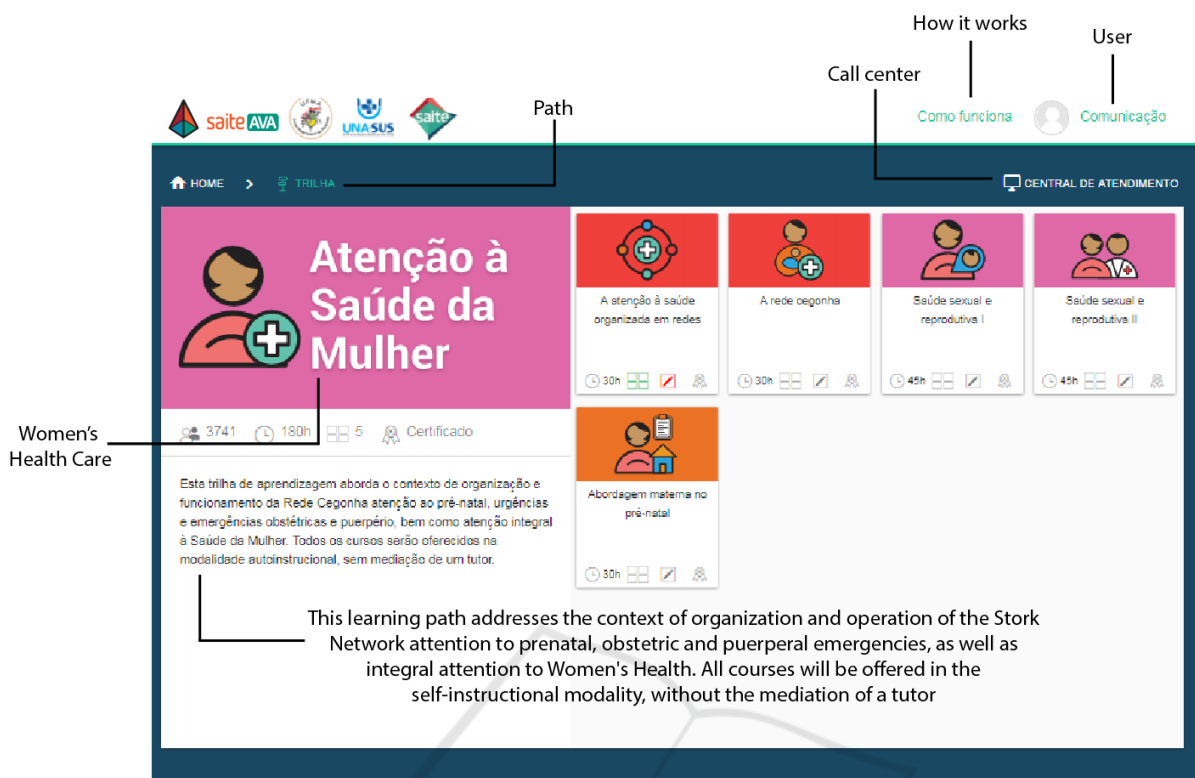
Figure 3: Paths Screen.