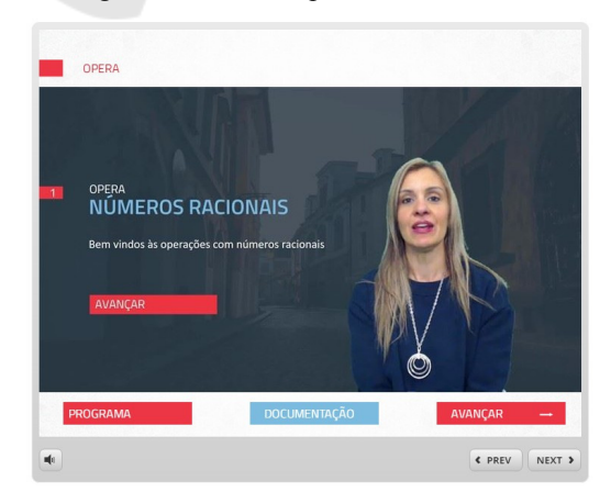
Figure 6: Video-presentation lesson of the real numbers module.