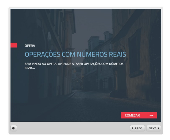
Figure 1: OPERA Input screen.

In Figure 1, we can see the welcome screen, with the theme to be studied and a button to start the course.