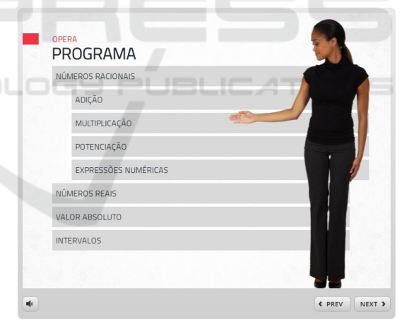
Figure 2: Thematic organization of OPERA.

OPERA presents a hierarchical approach to the issues, according to the thematic areas (Figure 2). The number of difficulty levels in each topic is set by default to two, but can be changed. All these definitions (questions, groups of questions, progression schemes) can be changed according to different courses and audiences. A progression scheme is directly connected to the topic, which means that it can include questions from different modules.