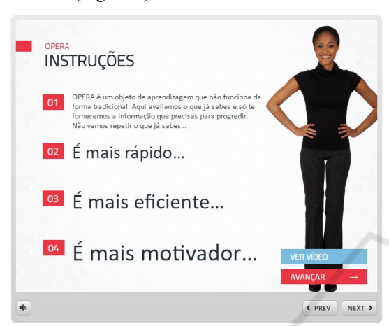
Figure 3: Presentation of the OPERA model.

in a short period of time, he can level up when compared to a student who had completed this same step with fewer right answers and over a longer period of time. In a given step, the behaviour of the progression scheme in function of the student's failure can be configured as: the student can repeat the step, be re-assigned to the previous step or additional information to study can be provided. Instructions are displayed on the screen so student understands how it will work (Figure 3).