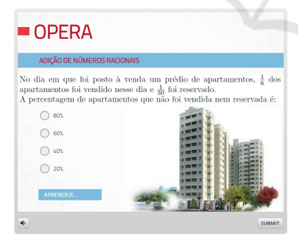
Figure 4: Example of an OPERA question.

Summing up, learning will be essentially done through the resolution of exercises (Figure 4). The questions can be formulated in a formal way or in a realistic way trying to facilitate the transfer of acquired knowledge (Figure 5).