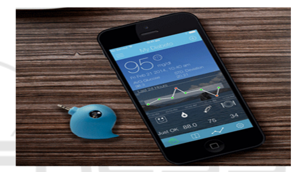
Figure 2: The synchronisation of the app with the glucometer.

In the next section, the situation related to diabetes in Sweden is presented.