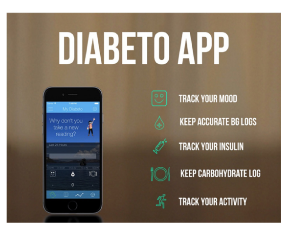
Figure 1: The Diabeto application.