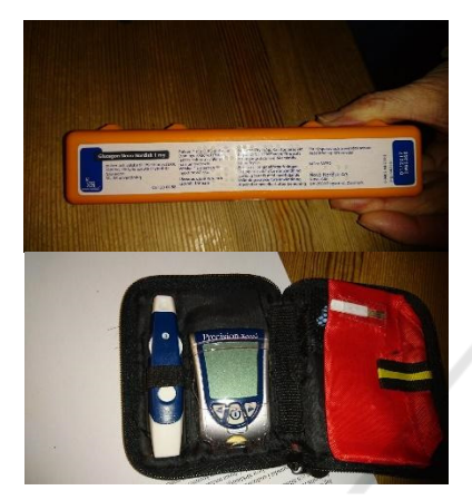
Figure 3: Example of children's "diabetes kit" in Sweden.

diabetes (Marmarelis and Mitis, 2014) are considered in essence in regular technical issue, with glucose insulin regulations. Furthermore, there are national approaches towards open quality assured databases such as the National Diabetes Registry, NDR with a specific open registry for children, Swediabkids. In the pictures below, figure 2, an example of a diabetes kit for children in Sweden is presented. Furthermore, continuous monitoring (CGM) like for example the automatic insulin pumps are examples of additional products in use.