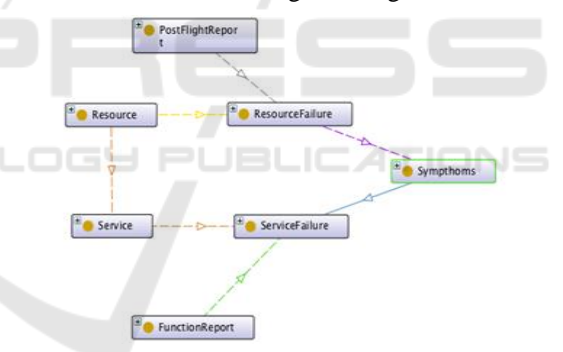
Figure 2: Failure sub-part of the Avionics Maintenance Ontology.

Similarly, for each flight an Electronic Log Book ( ELB ) entry is generated that registers the status of the aircraft, its flight departure and destination, its identification information and problems/observations and the actions taken, if any. It differs from the PFR in that the cause-effect-solution process is expressed in text (as a written report) rather than related to a specific component, with a specific failure message and a specific set of tasks established for solving/isolating the failure.