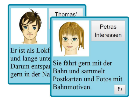
Figure 3: Players shall read, understand and relate texts.

Every game of the DT family is a combinatorial game. Within the family of combinatorial games, the board games form a quite prominent category. Board games are characterized by a board which consists of cells and by pieces which may be placed on cells, moved on the board, and so on. A board game is a path game , in particular, if most of its cells have exactly two different neighboring cells. Apparently, this is a fuzzy concept due to the imprecision of the term "most". A path game is a perfect one, if all cells have exactly two neighbors. The most simple variant of games in the DT family is a perfect path game .