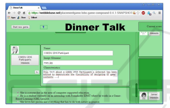
Figure 5: An early version of an editor for DT games; here is the English version in use where the piece has be renamed to "CSEDU 2016 Participant" with the picture "mary.jpg".

To prepare game play, educators assign similarity values to pairs of texts. A first version of an editor has been implemented (see fig. 5).