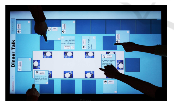
Figure 1: An early version of the core variant of the game family DINNER TALK on an Interactive Learning Table.

In response to the contemporary influx of refugees to Europe, the authors' team has developed a potentially infinite family of digital games (Arnold et al., 2016). A certain core implementation is available on-line at https://webblebase.net/placementgame.tobo.gamecompound-0.4.1-SNAPSHOT/index.html.