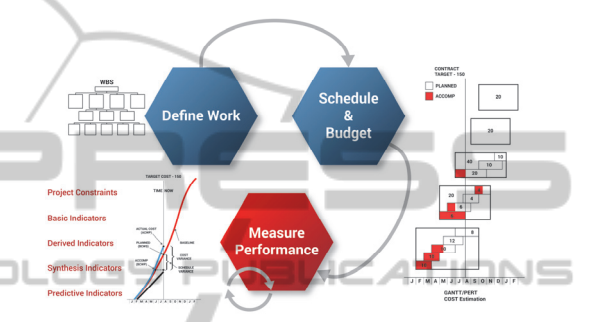
Figure 2: Project phases.

budget; (iii) measure performance. In "define work", project activities are identified and a work breakdown structure (or similar) is developed in order to identify the relations between the activities and work products. This structure should be detailed so the work can be categorized into individual elements of work. Next, in the "schedule and budget" phase, the project manager defines how the WBS activities are organized; Scheduling also involves arranging work packages into logical frameworks that define the project milestones. As the project progresses "monitoring and controlling" processes are carried out to measure performances.