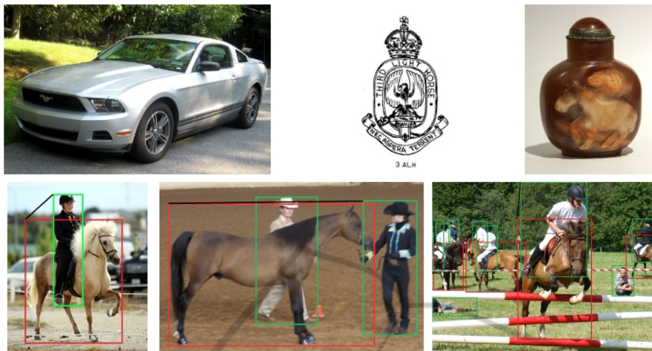
Figure 1: The upper row shows: A Ford Mustang, the 3rd Light Horse Regiment hat badge, and a snuff bottle. The lower row shows: A human riding a horse, one human leading the horse and one bystander, and seven riders and two bystanders. Bounding boxes are displayed.

solver (Stamborg et al., 2012) to parse the Wikipedia articles. For each word, the parser outputs its lemma and part of speech (POS). In addition, the parser produces a dependency graph with labeled edges for each sentence as well as the predicates it contains and their arguments. For each article, we also identify the words or phrases that refer to a same entity i.e. words or phrases that are coreferent.