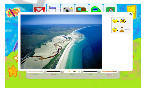
Figure 3: Message board.

For content preference sharing, associated to each multimedia content item (image, sound or video), there is a positive and a negative preference option. These allow the child to express and share with its counterparts at any time, his/her preference regarding the individual content item. This information is associated with the content and shown every time it is accessed, allowing all children to see the opinion of their colleagues. Figure 3 illustrates one of the activities with the content preference-sharing pane on the right side of the screen.