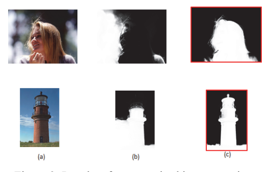
Figure 3: Results of unsupervised image matting.

Moreover, in order to highlight the performance of the proposed method, we infer the visual quality for image matting from human observers. This is due the fact that the three metrics mentioned above may not be representative of errors noticed by a human. Thus, the figure 3 shows some results of generated final alpha mattes. Figure 3(a) is the real images. Figure 3(b) is alpha mattes generated by spectral matting (Levin, 2008). Figure 3(c) is alpha mattes generated by our spectral matting.