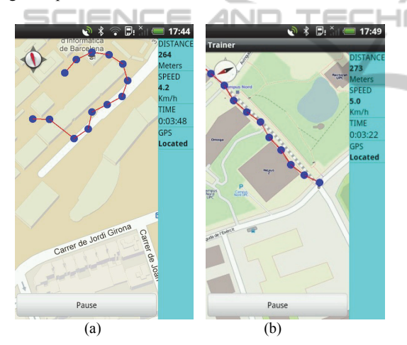
Figure 2: Screenshots: route tracked using Google Maps (a). Route tracked using OpenStreetMap (b).

The application has provided us useful types of data to analyze social activity. In the application the number and time when an SMS is sent or received has been monitored. It also has allowed tracking the duration, the number and the time of outgoing and incoming phone calls. Concerning the social networks, the application has been capable to analyze the activity on Facebook and Twitter. The application has obtained the number of friends that is associated with the contact network size. In addition to measure the social activity, the wall panel, messages and notifications have been checked. On Twitter social network published tweets by the user, mentions, direct messages, the number of followers and "following" have been quantified.