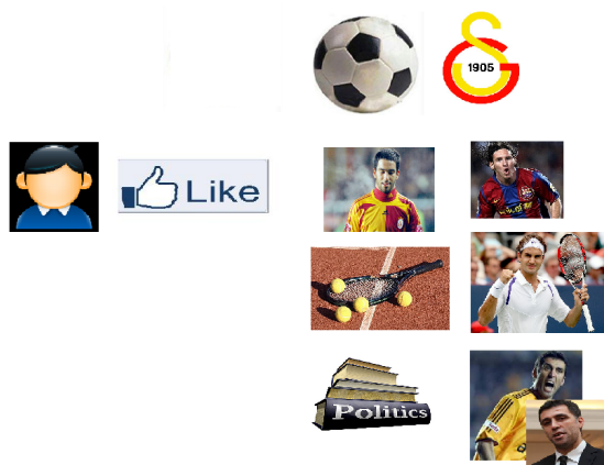
Figure 2: Raw User Profile for the user Feride.

ish football team, Arda Turan who was a Galatasaray football player, Lionel Messi who is a famous football player, tennis, Roger Federer who is a tennis champion, politics and a Turkish politician Hakan Sukur who used to be a Galatasaray football player. In order to semantically enhance the example raw profile, Wikipedia categories are searched in order to discover a super category for interest items. A partial Wikipedia category tree which spans the interest items in the sample profile is presented in Figure 3. Creating other spanning trees for profile items is possible, since the same item may be categorized under more than one category in Wikipedia category tree. The categories that match the example raw profile items are shaded in the figure. The constructed semantic user model is as follows: